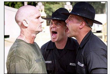
The First Two Weeks of Naval Boot Camp

One brazen gull, not too impressed with the newly discovered creature, picked up one of the fingers and flew off. Another gull landed on the creature's back, its feet sinking into the gooey-filmed skin, but then swiftly flew away. The rising tide crept in, reaching the tackle box and bait bucket until both were floating. The creature remained stationary, tilting its head to the left before letting out a deep, resonating belch.